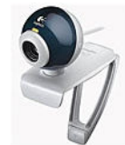
Logitech QuickCam Chat Webcam