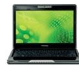
Satellite T115-S1100 Notebook