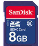
SanDisk 8GB SDHC Memory Card